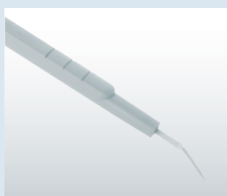
FOOT CONTROL PENCIL